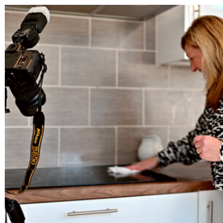
Home staging advice included